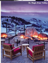
St. Regis Deer Valley