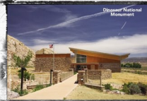
Dinosaur National Monument

VERNAL Drive east to reach the small town of Vernal, the gateway to Dinosaur National Monument . While the park is famous for its wall of dinosaur bones, design buffs will love its Quarry Exhibit Hall, which was originally built in 1908 in classic modernist style. The building houses a preserved slice of quarry wall that encompasses more than 1,000 embedded dinosaur fossils. Also, don't miss out on the park's numerous petroglyphs and the remains of the Jose Morris Cabin, a female cattle rancher's homestead. Back in town, unwind with a craft beer such as the Allosaurus Amber , at the glass-enclosed Vernal Brewing Company .