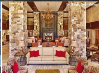
Park City Mountain Resort