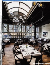
Riverhorse on Main